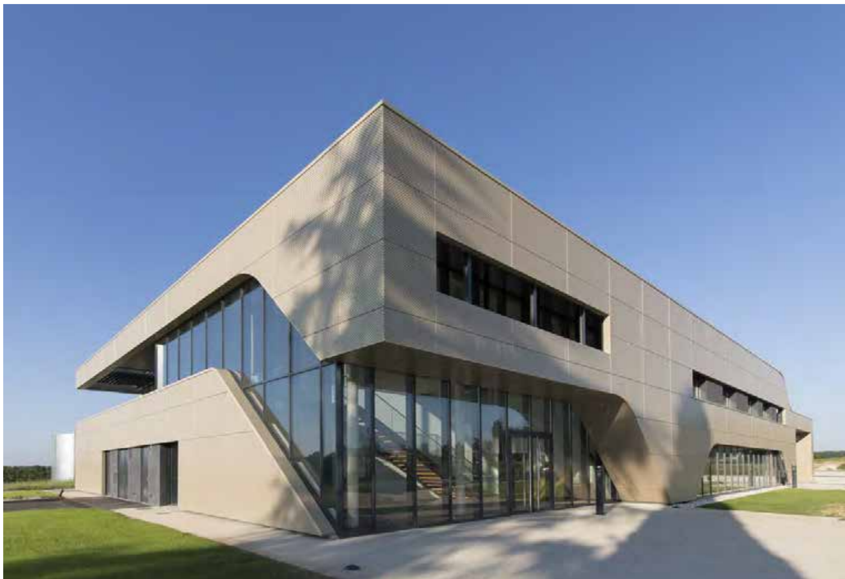
ALMA F.R.C, Magnac-Lavalette, Charente, France

ALMA F.R.C. WORLD LEADER IN LEATHER CARE AND SHOE ACCESSORIES.