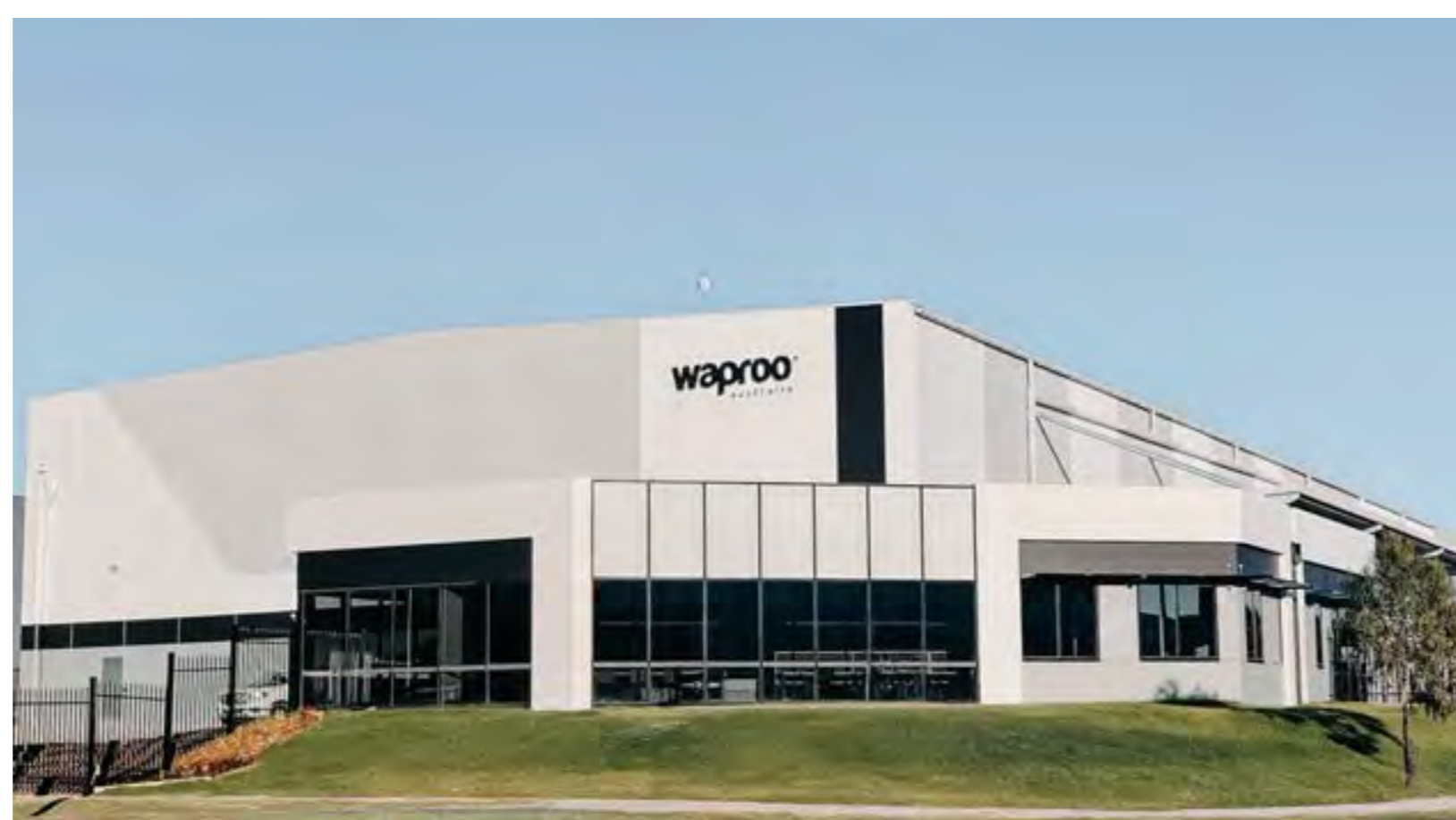
Dandenong South, Australia